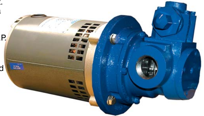
GMC1DE3–E1.5 1P SHOWN

These cast iron gear pumps are reliable, cost-effective and low maintenance.