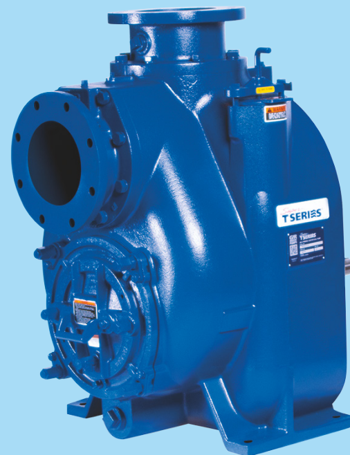
Shown with Optional Suction and Discharge Spool Flanges (Available in ASA or DIN Standard Sizes).

200 mm DIN 2527 – PN 16 (Specify Model T8E60SC-B /FM).