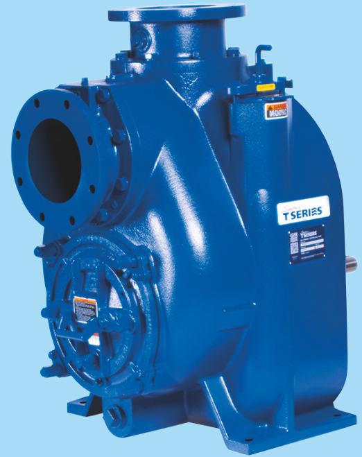
Shown with Optional Suction and Discharge Spool Flanges (Available in ASA or DIN Standard Sizes).