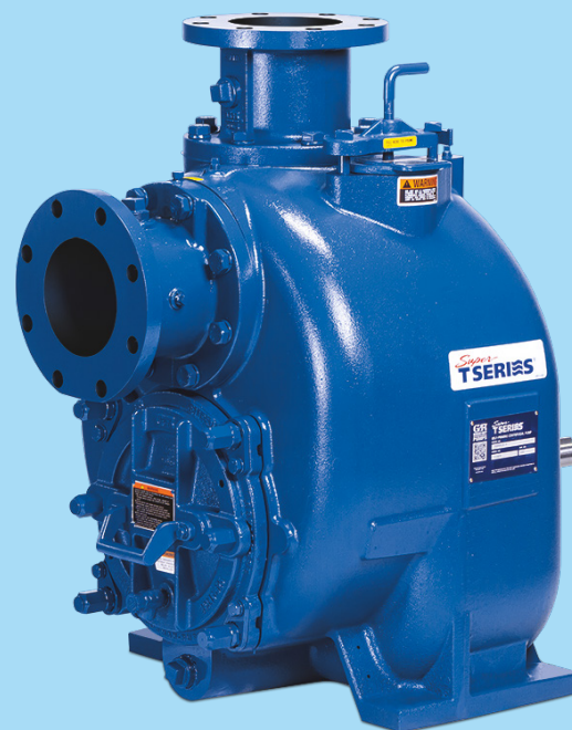
Shown with Optional Suction and Discharge Spool Flanges (Available in ASA or DIN Standard Sizes).

150 mm DIN 2527 – PN 16 (Specify Model T6E60SC-B /FM).