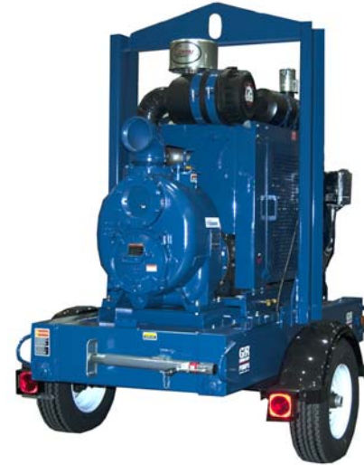
SHOWN WITH OPTIONAL WHEEL KIT