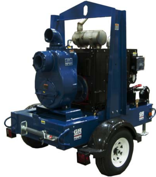
Shown w/Optional Wheel Kit

*Consult Factory for Applications Exceeding Maximum Pressure and/or Temperature Indicated.