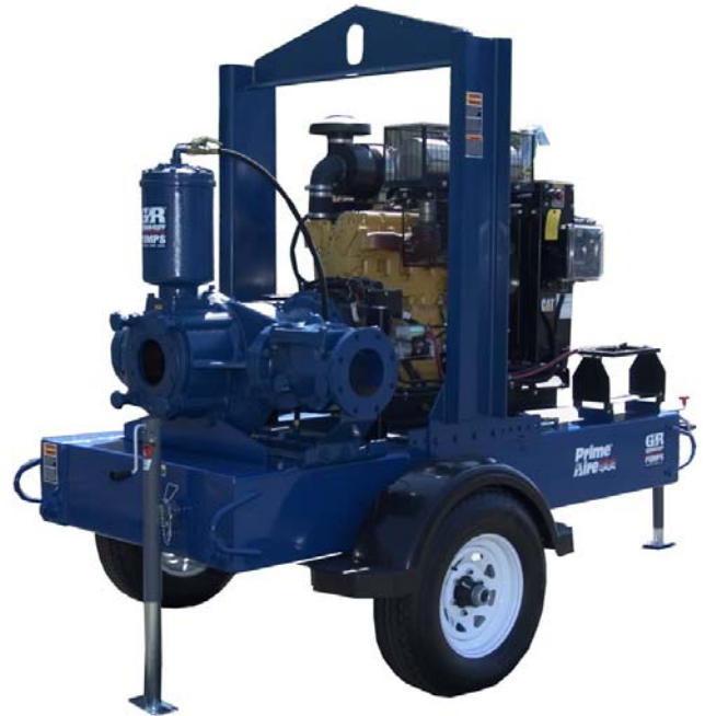
SHOWN WITH OPTIONAL WHEEL KIT

Optional Equipment: Battery. Suction and Discharge NPT Threaded Flange Kits. High Speed (55 MPH/89 KM/H) Single Axle Pneumatic-Tired Wheel Kit. Tandem Axle Over-the-Road Trailer (Meets DOT Requirements) Available w/Either Electric or Hydraulic Surge Brakes, Running Lights, Jack Stands and Safety Cables/Chains. EPS w/Submersible Transducer Liquid Level Sensor. **