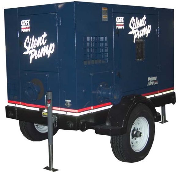
SHOWN WITH OPTIONAL WHEEL KIT