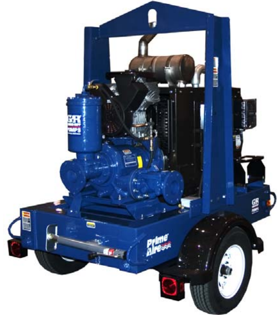
SHOWN WITH OPTIONAL WHEEL KIT

Optional Equipment: Battery. Belt-Driven Diaphragm Primer. High Speed (55 MPH/89 KM/H) Single Axle Pneumatic-Tired Wheel Kit w/wo DOT-Approved Lights and Electric Brakes. Heated Priming Chamber Kit. Tandem Axle Over-the-Road Trailer (Meets DOT Requirements) Available w/Either Electric or Hydraulic Surge Brakes, Running Lights, Jack Stands and Safety Cables/Chains. Full Feature Control Panel For Use w/Submersible Transducer Liquid Level Sensor (50 Ft. [15 M] Cable Standard, Alternate Lengths Available).