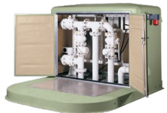
ReliaSource® Above-Ground Submersible Valve Package (ASVP)

ReliaSource lift stations are shipped complete from the factory, ready for professional installation. Just add power and connect piping for years of reliable lift station performance.