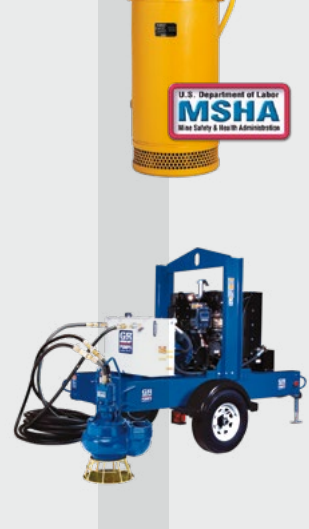
SM Series MSHA Approved

Max Head: 600' (182.9 m) Max Solids: 1" (25.4 mm) Horsepower: 2 HP - 275 HP