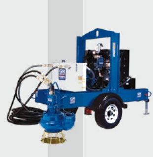
HS Series® Hydraulic Driven

Max Head: 380' (115.8 m) Max Solids: 0.5" (12.7 mm) Horsepower: 1 HP - 60 HP